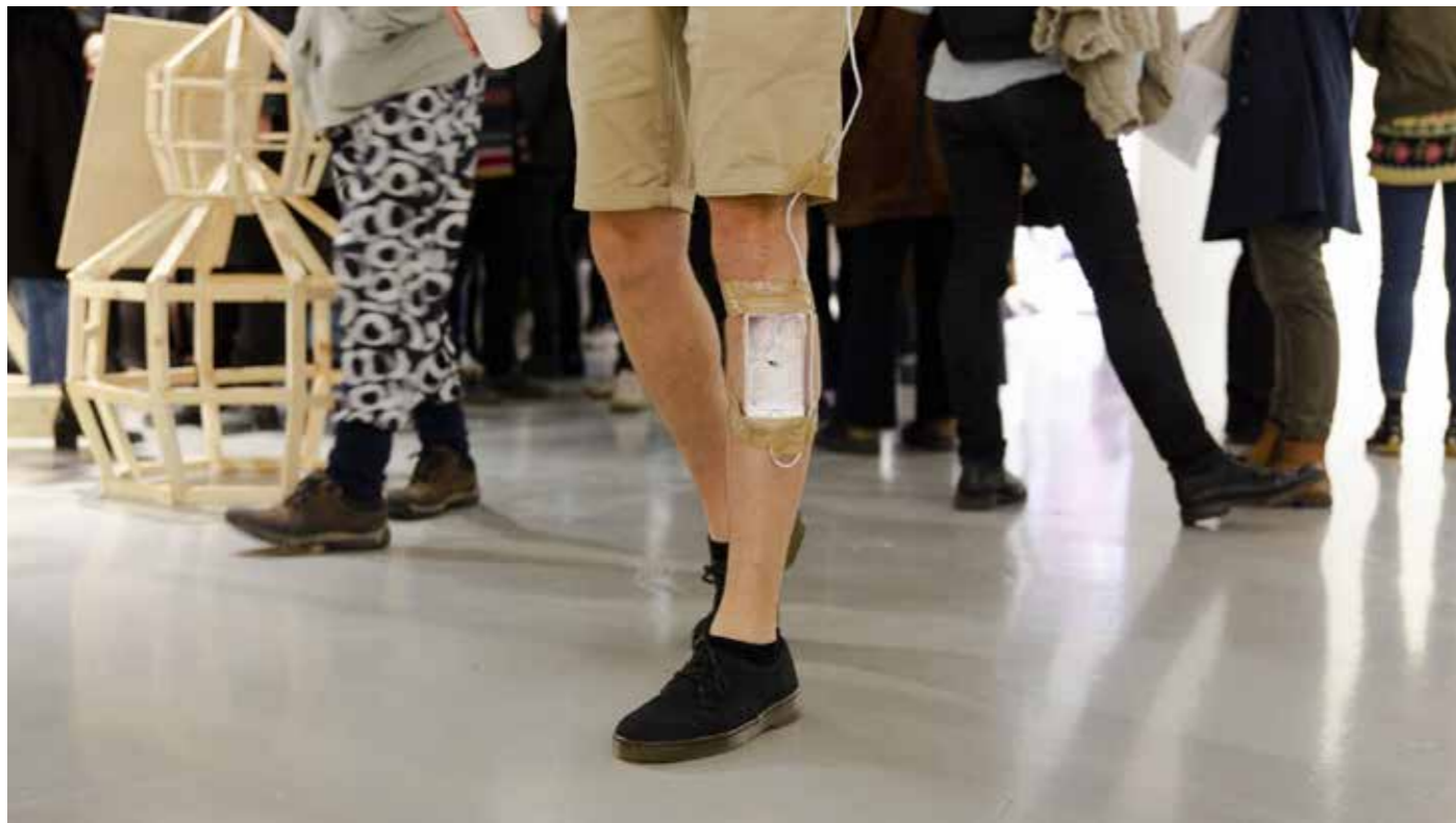
Documentation from the performance