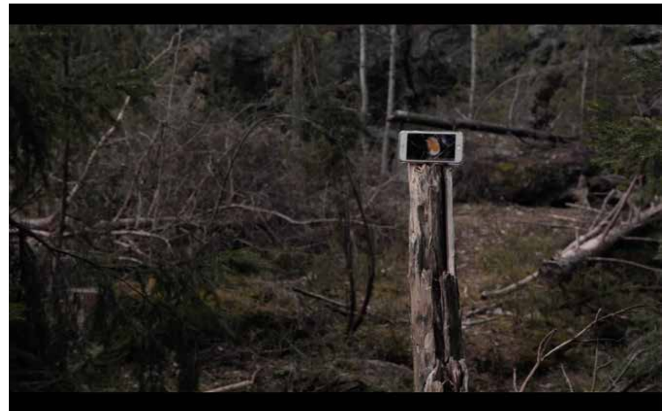
Still picture from the video The Rivals