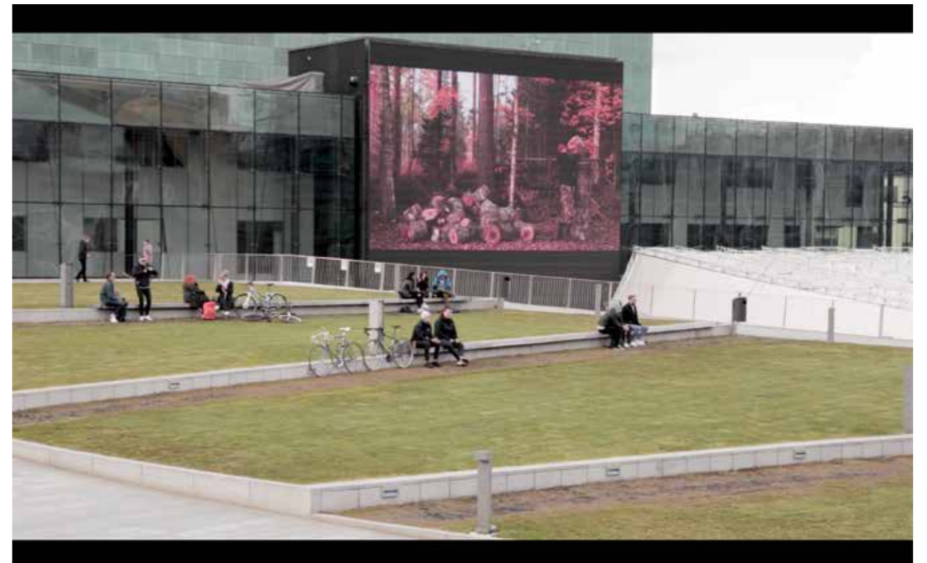
Documentation from Musiikkitalo (2020)