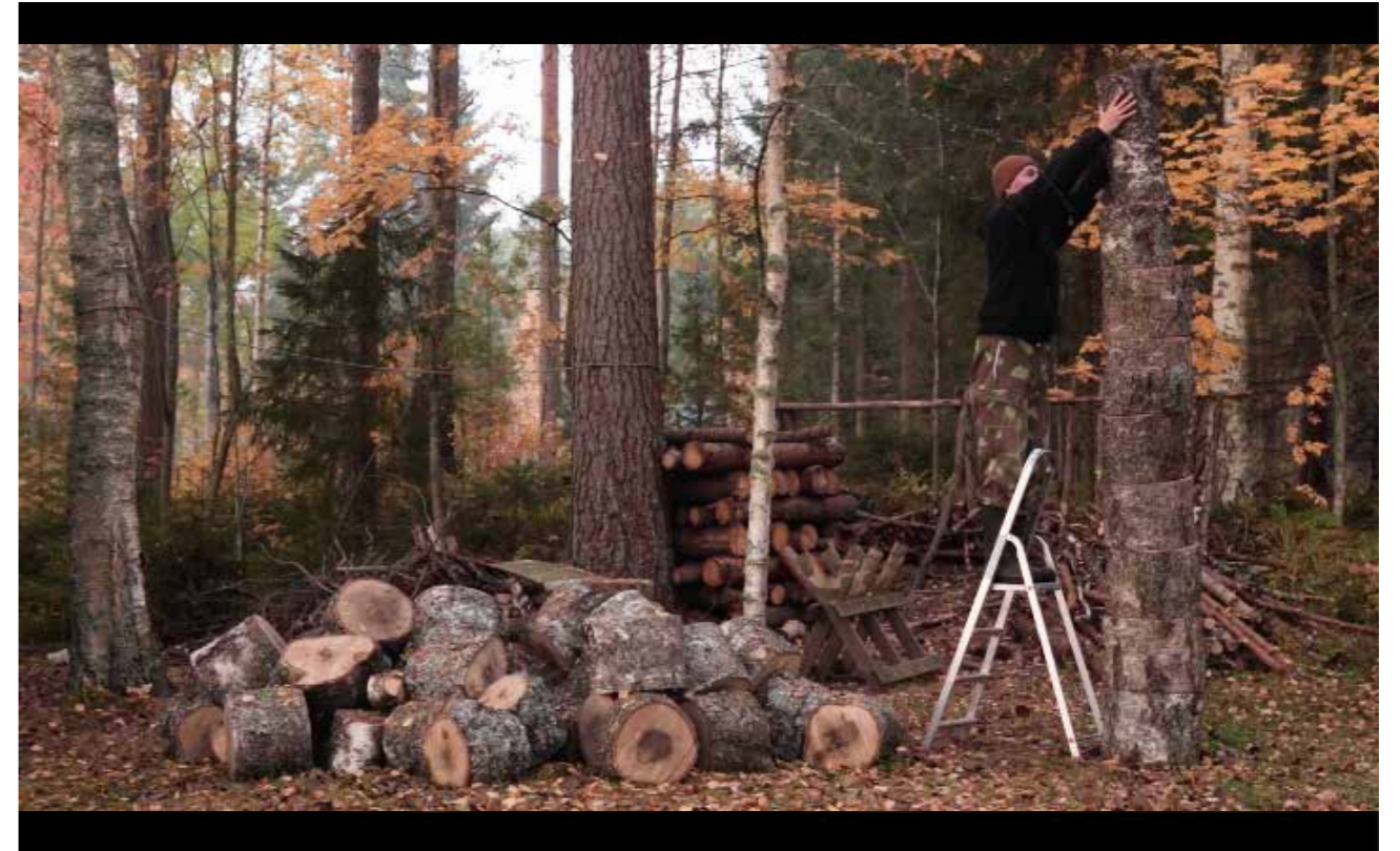
Still picture from the video Totem

I built a totem from blocks of birch and repeated the performance three times. Each time I got further.