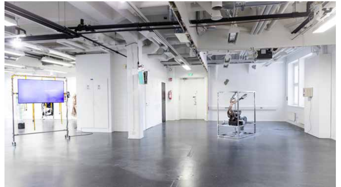
Installation view from Kuvan Kevät 2021 - Exhibition